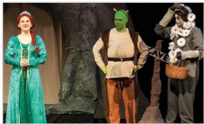
Shrek, performed in 2014

Please complete the pledge form on the next page to begin your gift.