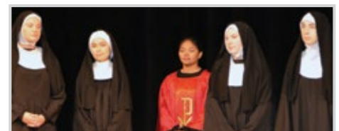
Honouring the Arts in Education