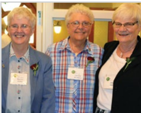
Come and Go Reception

Honouring the Arts in Education: a collaborative effort with St. Mary’s Academy to highlight and celebrate the performing, visual and culinary arts.