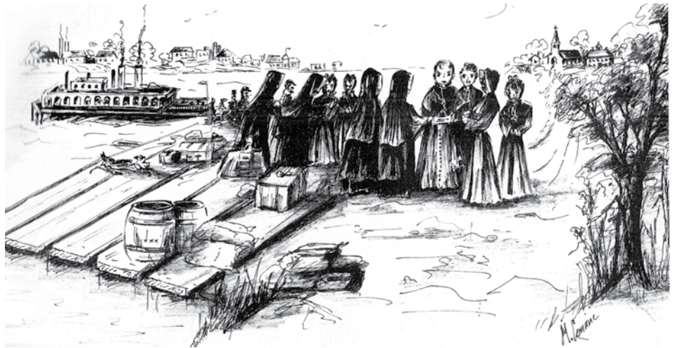
SNJM greeted by the Grey Nuns on the banks of the Red River in 1874

One hundred and forty years later it is clear the Sisters have been faithfully involved in “the Church’s mission of education in the faith” (Constitution #11). The Sisters have taught students from nursery school to university, in both English and French and cultivated the arts—musical, visual, dramatic, culinary and textile. They have worked in parishes, coached sports teams, led adult faith groups, welcomed refugees and collaborated with others in the promotion of justice.