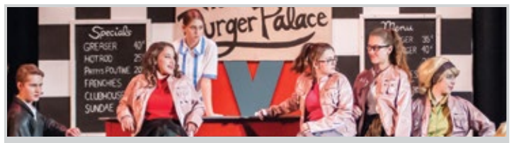
Grease, performed in 2013