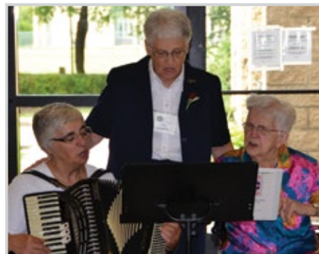
Come and Go Reception