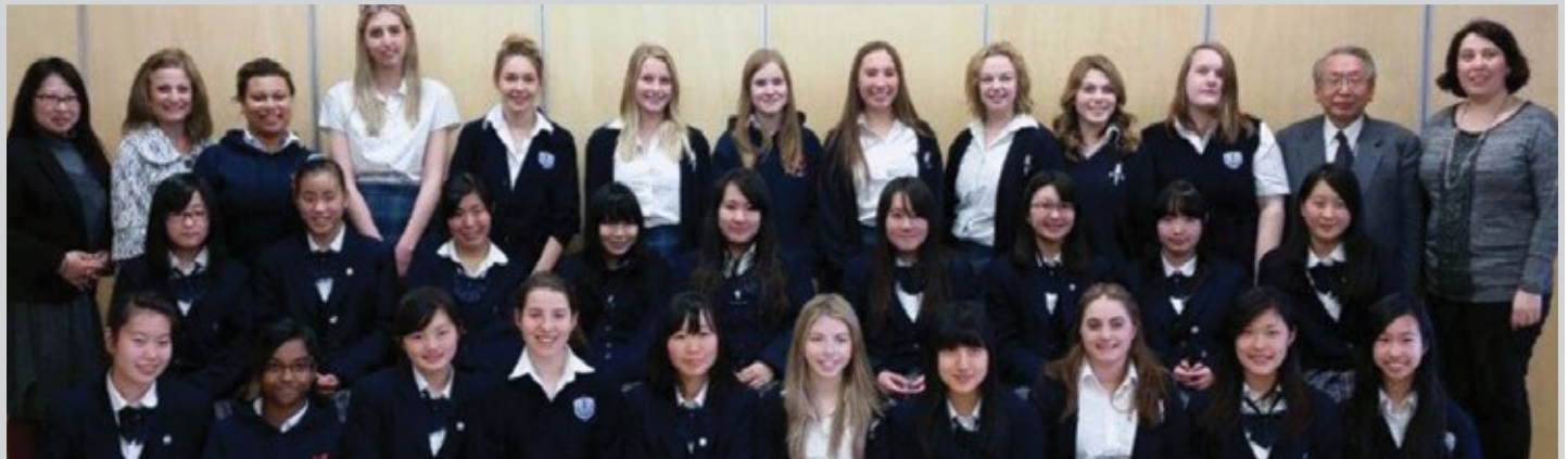
Official Closing Ceremony

calligraphy, cooking, music, traditional tea ceremony and kimono dressing. Excursions to Kamakura, Enoshima, Yokohama and downtown Tokyo were also highlights of this travel exchange opportunity.