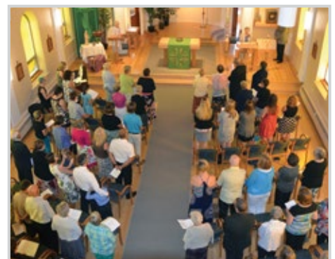
July 31, 2015 ceremony in Holy Names Chapel